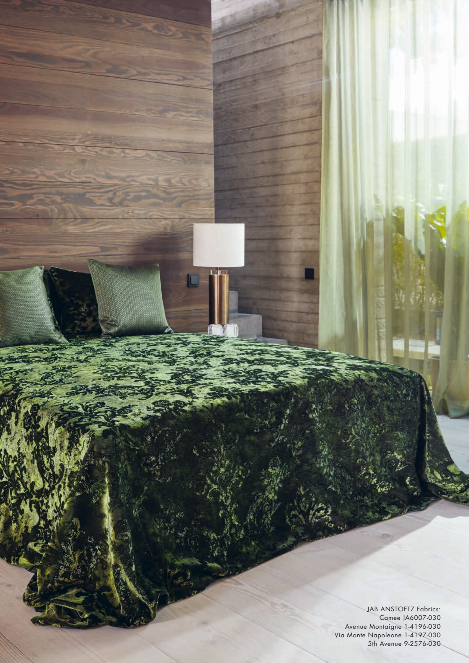
JAB ANSTOETZ Fabrics: Camee JA6007-030 Avenue Montaigne 1-4196-030 Via Monte Napoleone 1-4197-030 5th Avenue 9-2576-030