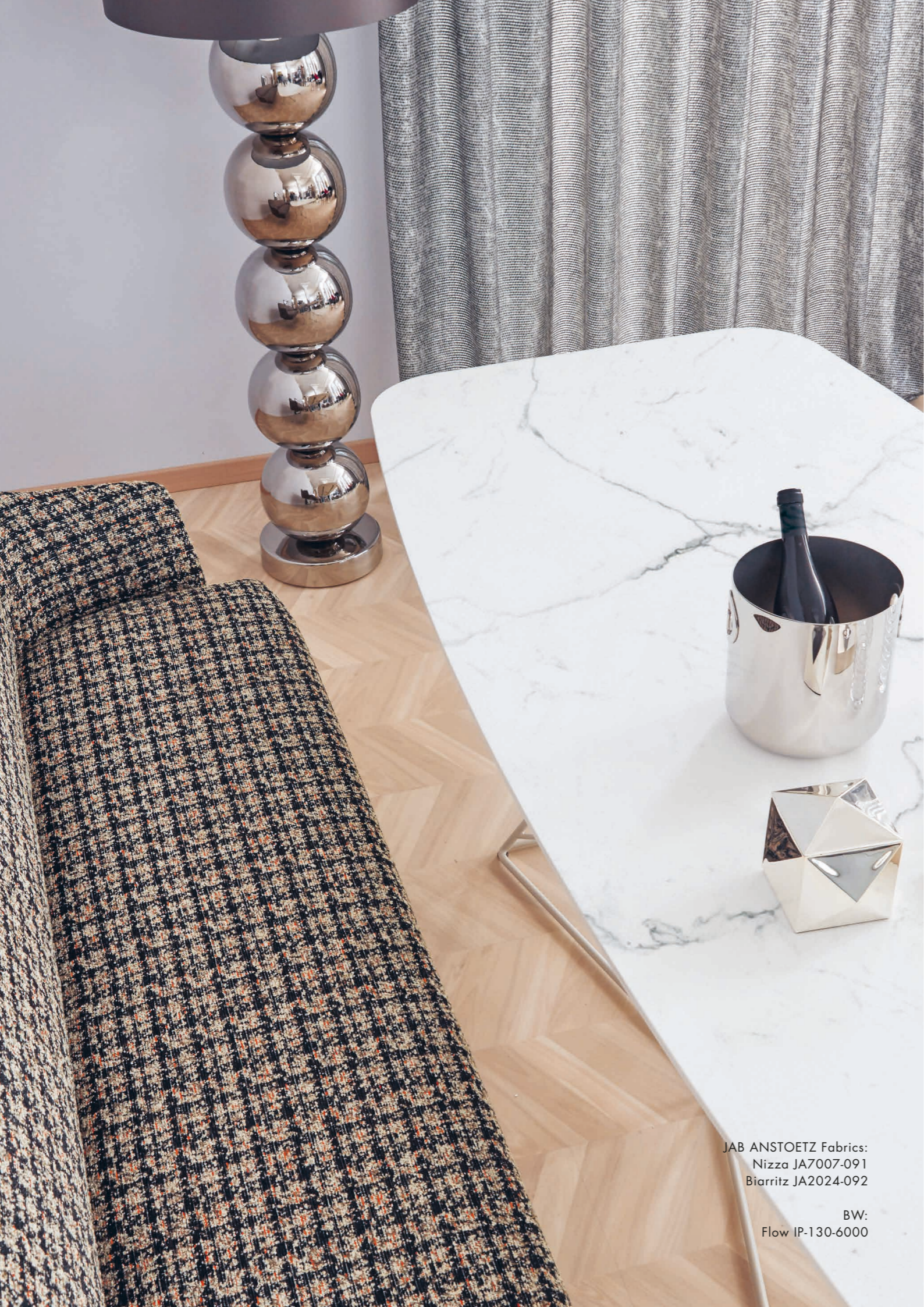
JAB ANSTOETZ Fabrics: Nizza JA7007-091 Biarritz JA2024-092