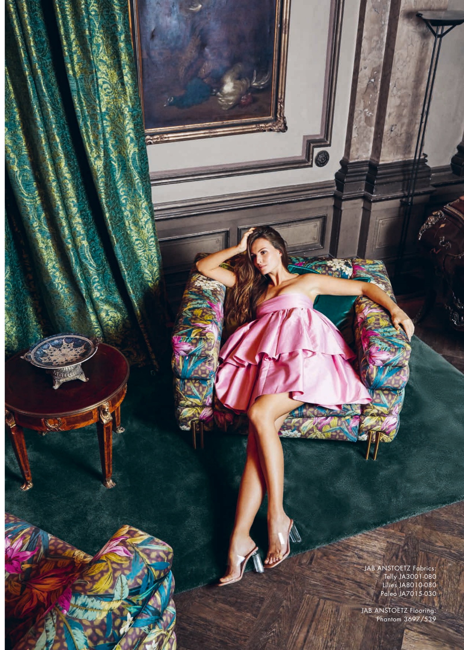
JAB ANSTOETZ Fabrics: Telly JA3001-080 Lilies JA8010-080 Paleo JA7015-030