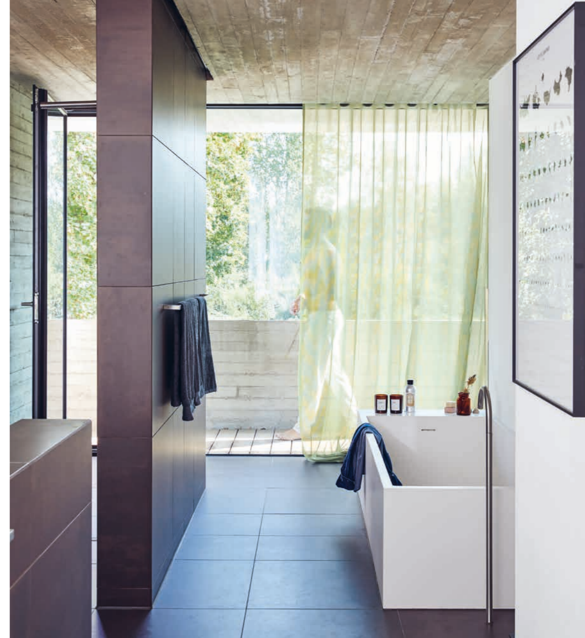
JAB ANSTOETZ Fabrics: Camee JA6007-030