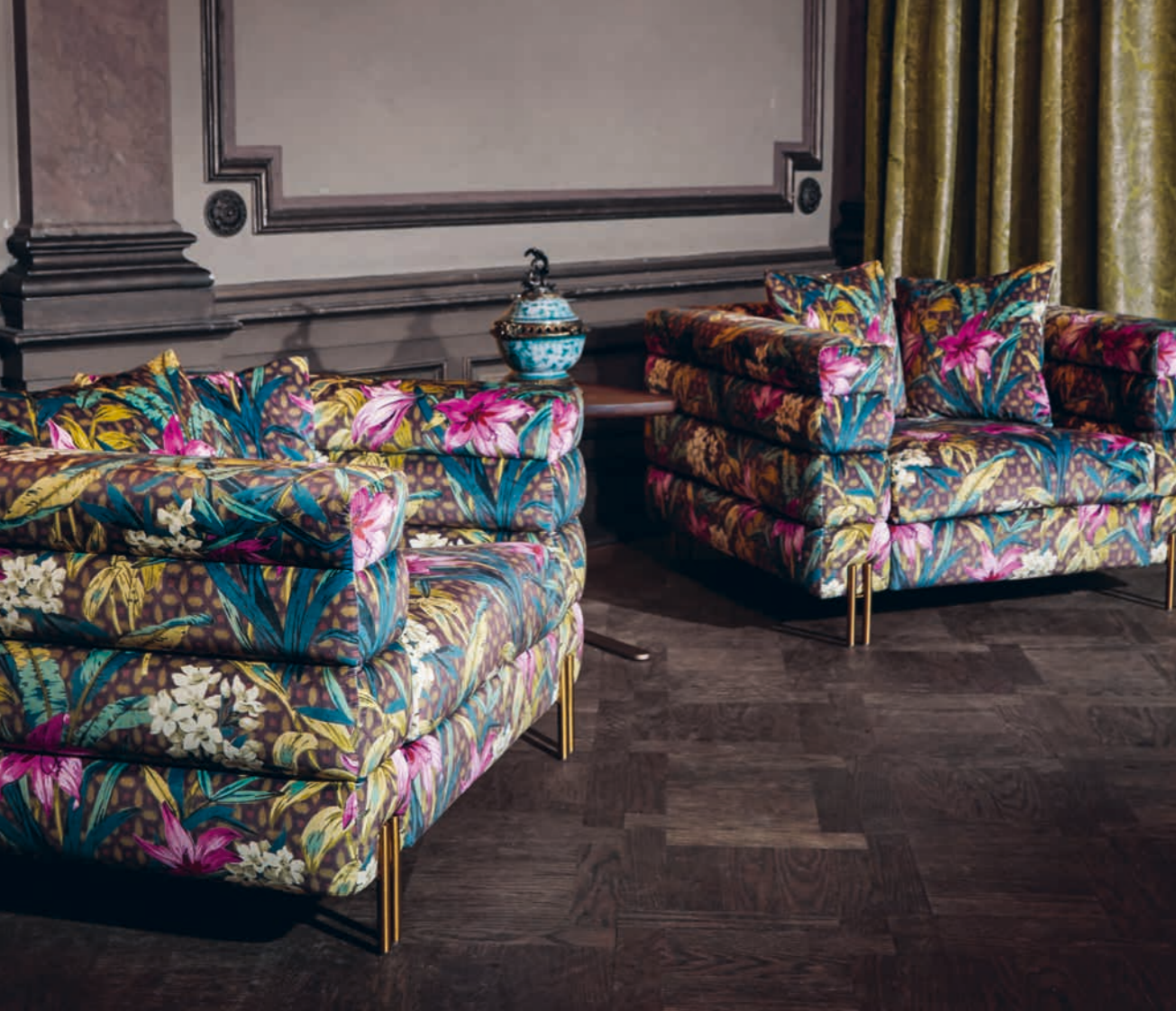
JAB ANSTOETZ Fabrics: Jaipur JA7016-030 Lilies JA8010-080